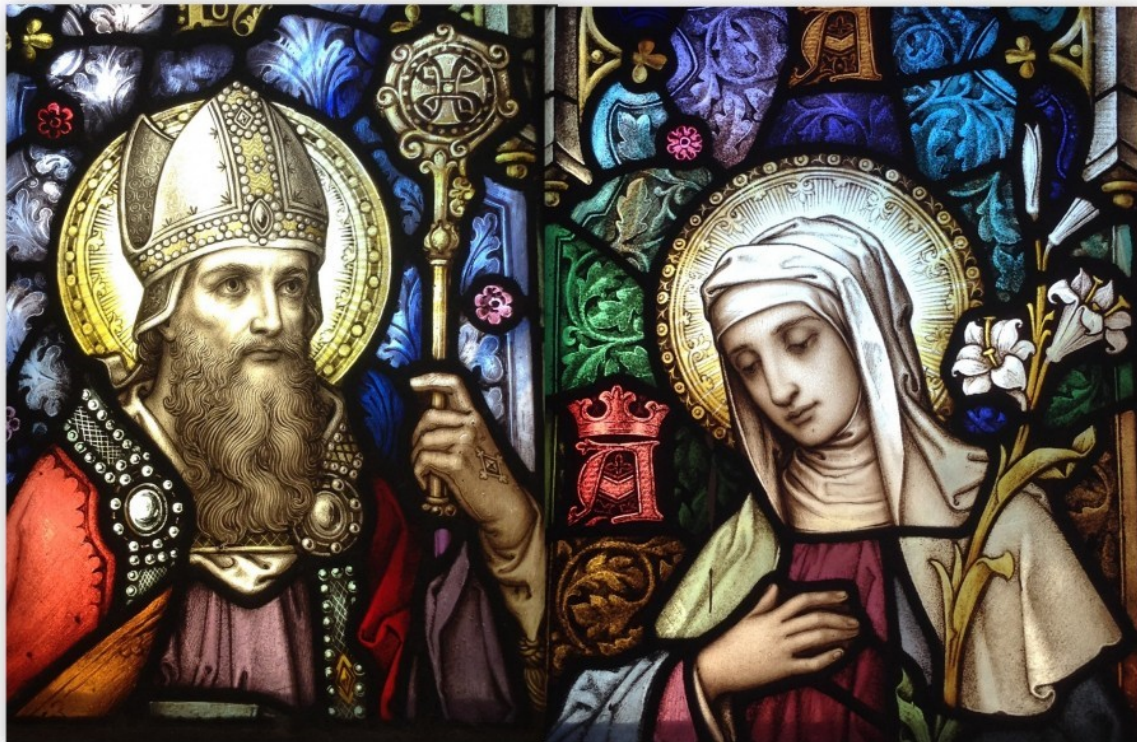
Ss Nathy and Attracta

19th Sunday of the Year – 10th August 2014