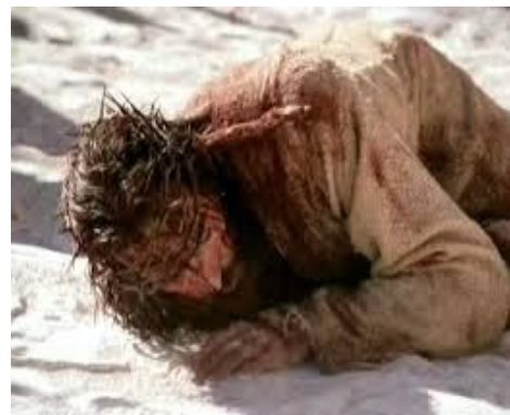
Jesus falls for the first time.

At the third station of the Cross, we reflect on the first fall of Jesus. Though it's not recorded as such in Scripture, it's certain there were moments on the Calvary Road when Jesus collapsed beneath the uninvited and equally undeserved weight of the cross.