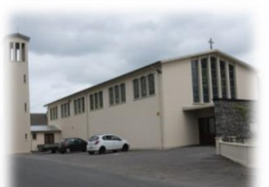
St Celsus' Church -Kilkelly