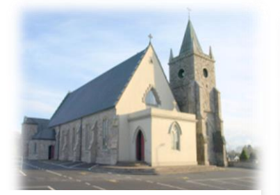
Church of Immaculate Conception - Kilmovee

WEBSITE kilmoveeparish.org ITEMS FOR NEWSLETTER <u>news@kilmoveeparish.org</u>