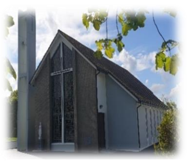
St Joseph's Church -Urlaur